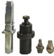
COLD FORMED PARTS